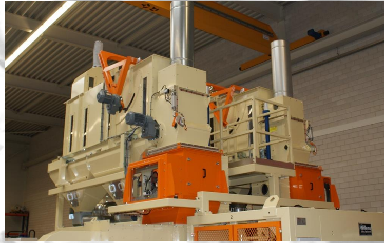
Hay dosing system

7400 x 6950 x 6000 mm (LxWxH). 291" x 273" x 236" (LxWxH).