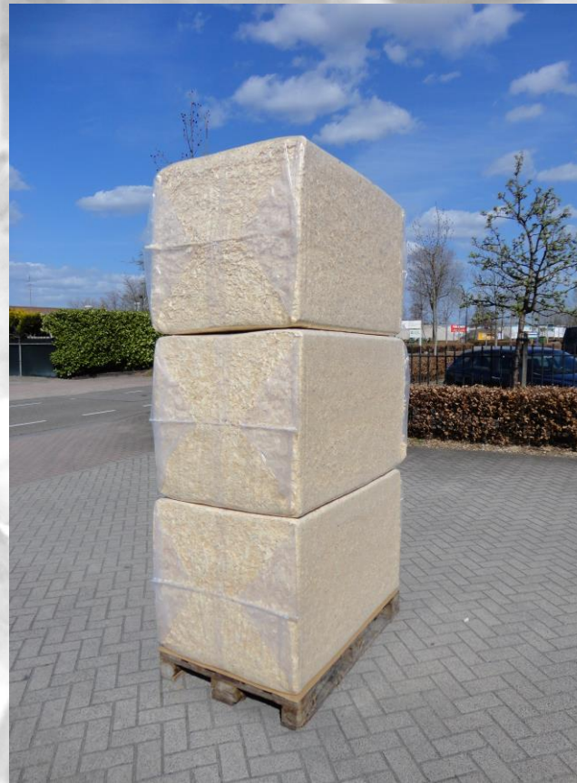
Bales stacked on a pallet

Ca. 150-180 kg (depending on bulk density and compression ratio).