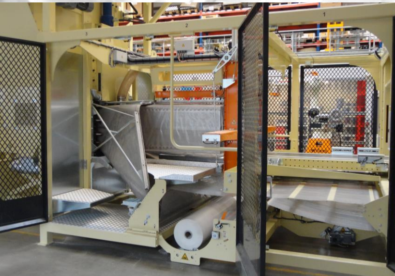
Packaging out of flat foil