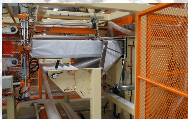
Packaging out of flat foil