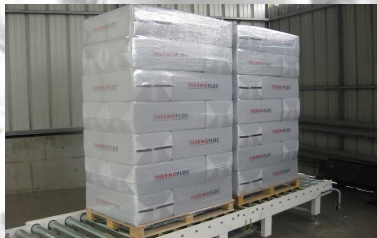
Bales stacked on a pallets