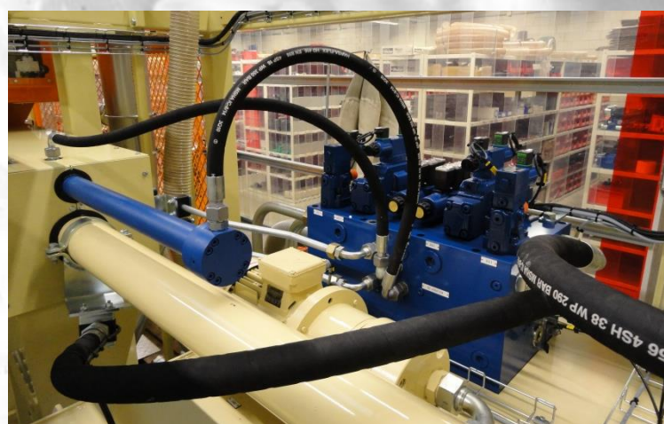
Hydraulic compression system