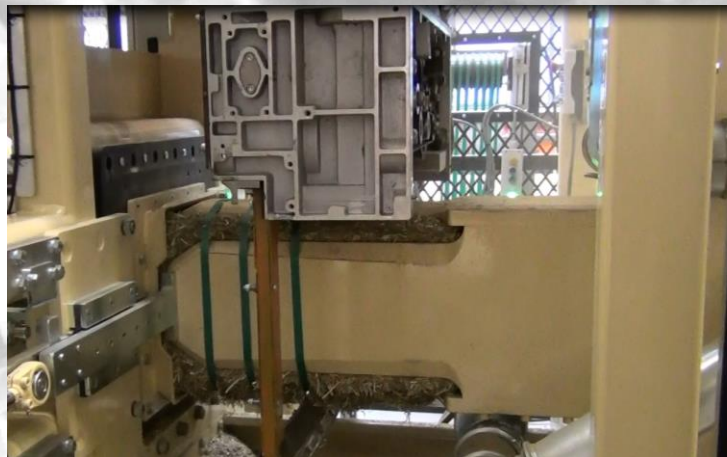
Straps for holding the high compressed bale together

9000 x 3250 x 6000 mm.(LxWxH). 354" x 127" x 236" (LxWxH).